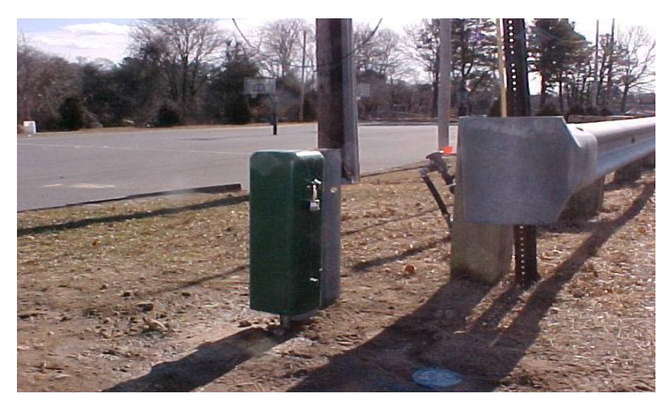
Dedicated Sampling Station - Marion Road

Radon is a radioactive gas that you cannot see, taste, or smell. Radon can move up through the ground and into a home through cracks in the foundation. Radon can build up to high levels in all types of homes. Radon can also be released from tap water when showering, washing dishes, or doing other household activities. Compared to radon entering the home through soil, radon from tap water will in most cases be a small source of radon in indoor air. Radon is a known human carcinogen. Breathing air-containing radon can lead to lung cancer. Drinking water containing radon may also cause increase risk of stomach cancer. If you are concerned about radon in your home, test the air in your home. Testing is inexpensive and easy. Fix your home if the level of radon in your air is 4 Pico curies per liter of air (pCi/l) or higher. There are simple ways to fix a radon problem that are not too costly. For additional information, call your State radon program or call EPA's Radon Hotline (800.SOS.RADON)