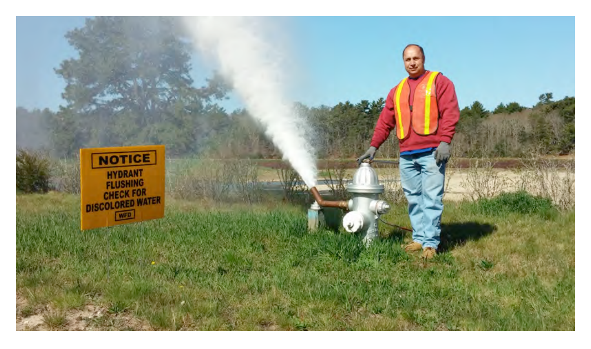
Annual Springtime Uni-Directional Hydrant Flushing Program

Fecal Coliforms and E-coli are bacteria whose presence indicates that the water may be contaminated with human or animal wastes. Microbes in these wastes can cause diarrhea, cramps, nausea, headaches or other symptoms. They may pose a special health risk for infants, young children, some of the elderly, and people with severely compromised immune systems.